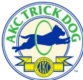
TRICK DOG (Novice through Performer)